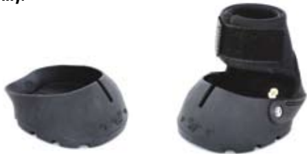
The New Easyboot Glue-On

Note: The EasyCare Fit Kit is for the Easyboot Glove and Easyboot Glue-On only.