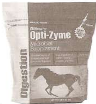
Digestion . . . page 11

Your horse might be eating everything you give him, but is it settling well or could he have a constant, nagging stomachache?