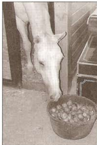
Insulin Resistance . . . page 3