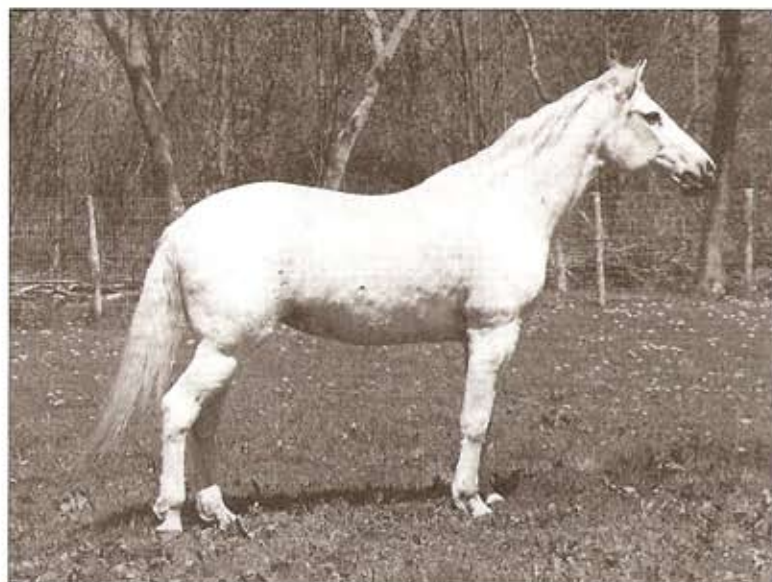
Melanomas . . . page 9

Our 10 favorite products from this year's trials.