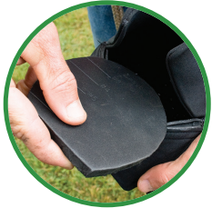
Comfort Pad provides additional support