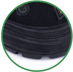
Cushioned sole provides maximum comfort