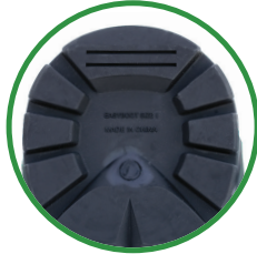
Semi-aggressive tread provides traction