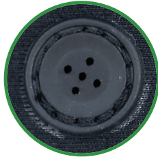
Air vents provide air circulation around the hoof