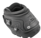
Easyboot Back Country