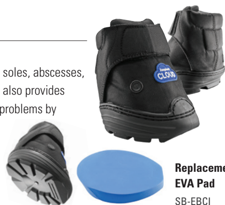
Replacement EVA Pad SB-EBCI

As with any hoof or leg related injury, consult your veterinarian or hoof care professional for diagnosis and treatment recommendations