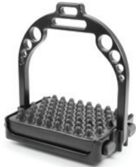
E-Z Ride Ultimate Ultra SS-UU-C5