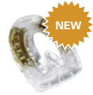
EasyShoe Versa Grip Gold