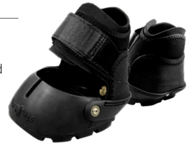
Size Chart – Normal

No external hardware means that there is no need to worry about grass or sticks getting caught in the boots. And because the material stretches over the hoof and clings to the wall, debris stays out of the boot even through sandy and muddy conditions. The elastic cap at the rear of the gaiter fits the contours of the heel bulb while offering generous proportions of stretch and strength. Power Straps are recommended for aggressive riding, hilly terrain and muddy conditions.