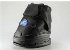
Therapy Click 5 Degree