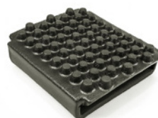
E-Z Ride Nylon Stirrup Slip-On Pads SS-SLIPPAD