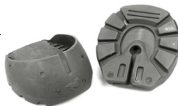
Size Chart – Normal

It can be common to see 4-8mm of heel expansion in each four to six week application. The length of the LC is longer than other EasyCare models and should be cut to fit. Cuff height has two lines that guide trimming the upper if a lower profile install is desired. Four holes in the cuff act as dowel pins and strengthen the adhesive bond. When applying the Easyboot LC for a full trim cycle we recommend pretreating the sole with an antimicrobial hoof putty to help prevent the occurrence of thrush.