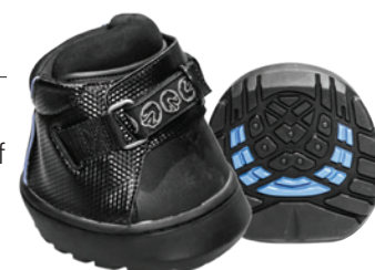
Size Chart – Normal

Offered in both regular and narrow pattern sizing, the Easyboot Sneaker will cover a wide variety of hoof sizes. With the option to add quick studs for additional grip on snow and ice, the Easyboot Sneaker is a true year-round option for protecting the hoof.