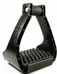
Nylon Standard SS-STIR Top bar sizes: 1.5", 2", 2.5" or 3"