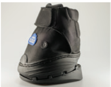
Therapy Click 10 Degree