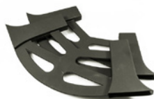
Stirrup Slip-On Cage (Nylon Only) SS-SLIPCAGE