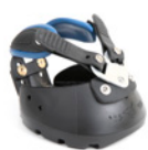
Easyboot Fury Heart