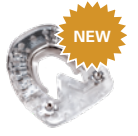
EasyShoe Versa Grip w/Studs