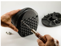
Insert 4 self-tapping screws