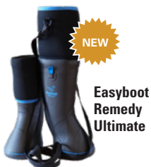
Easyboot Remedy Ultimate