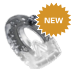
EasyShoe Versa Grip