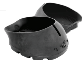
Size Chart – Normal

In order for this boot to work properly, it requires a snug fit. The foot must be dry during application and the glue-on process must be carefully followed. We don't recommend leaving the boot on for more than 10 days in a dry environment or 5 days in a wet, humid environment. Refer to the Easyboot Glue-On Application Guide for complete instructions.