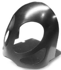
Cage SS-UC-C5 for E-Z Ride Ultimate Ultra Stirrups, Pair